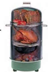
Brinkmann 28" Green

But a drill, a bit and a trip to Home Depot for a grill thermometer will fix that rascal. Another popular brand is Brinkmann available at Cooking.com and Amazon . Typically, Brinkmann's do not have vents for temperature control, but because of their pricing we include them here for the beginner. They sell several variations including electric and charcoal smokers with dual-layer 19" and dual-layer 28" for someone looking to get started within a reasonable price range. Shop around and you will find many others out there that fit the bill.